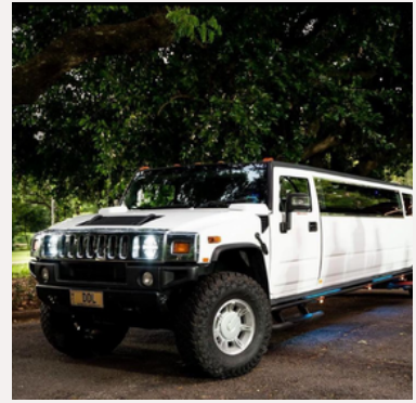
Darwin Deluxe Limos