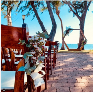
Wedding Day Flair